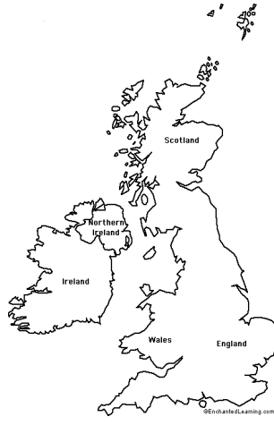
The United Kingdom