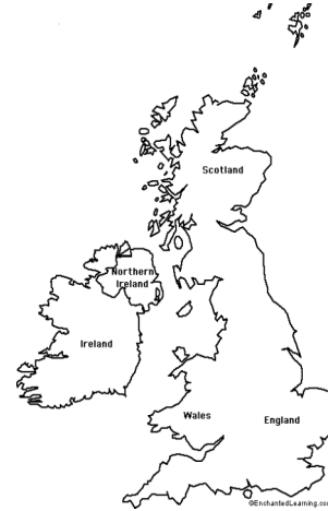
The British Isles

2. Ireland has got two names? Which are they?